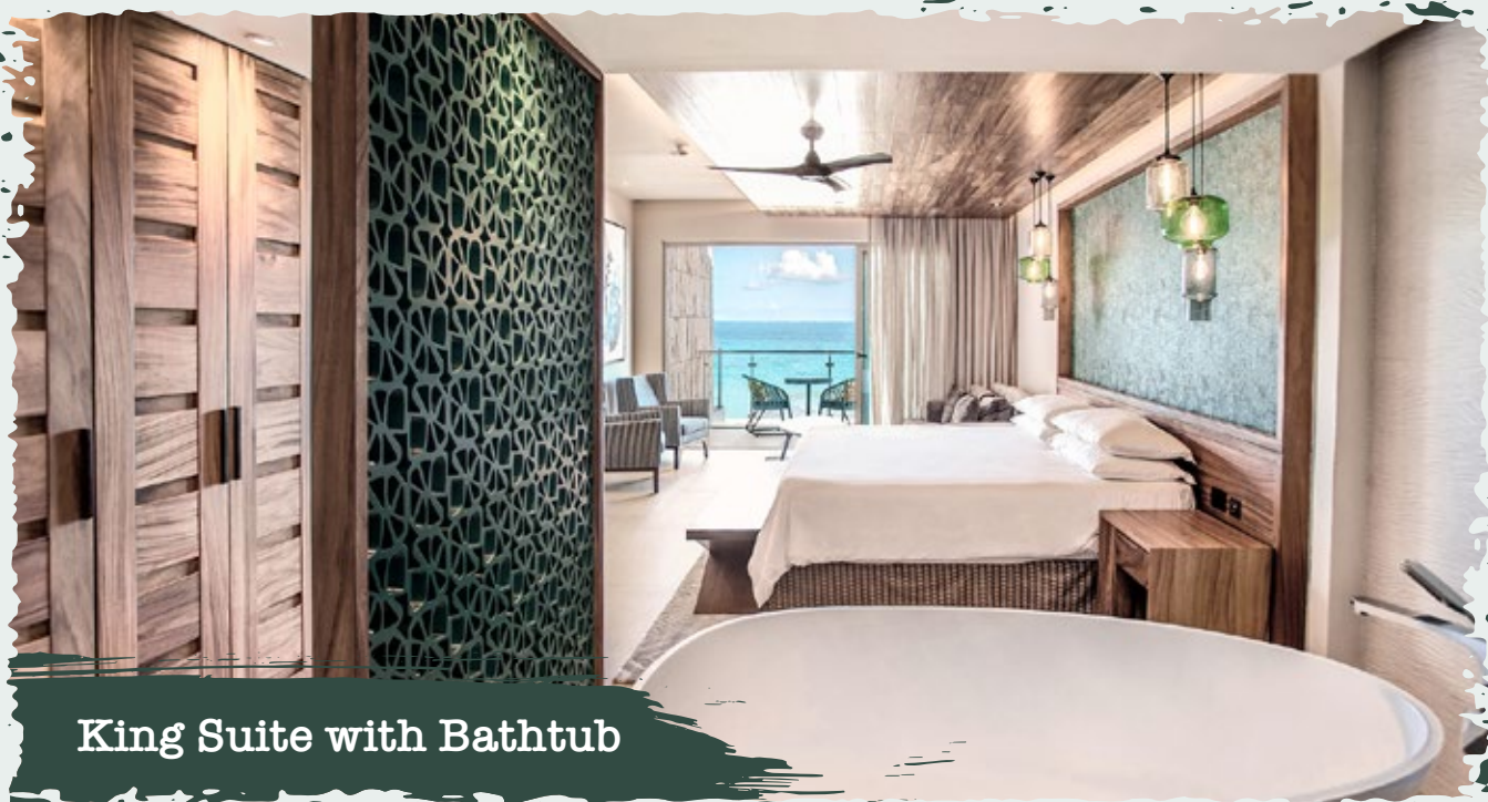
King Suite with Bathtub