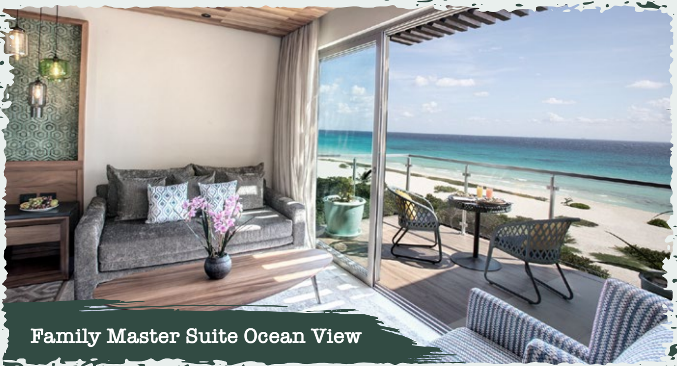
Family Master Suite Ocean View