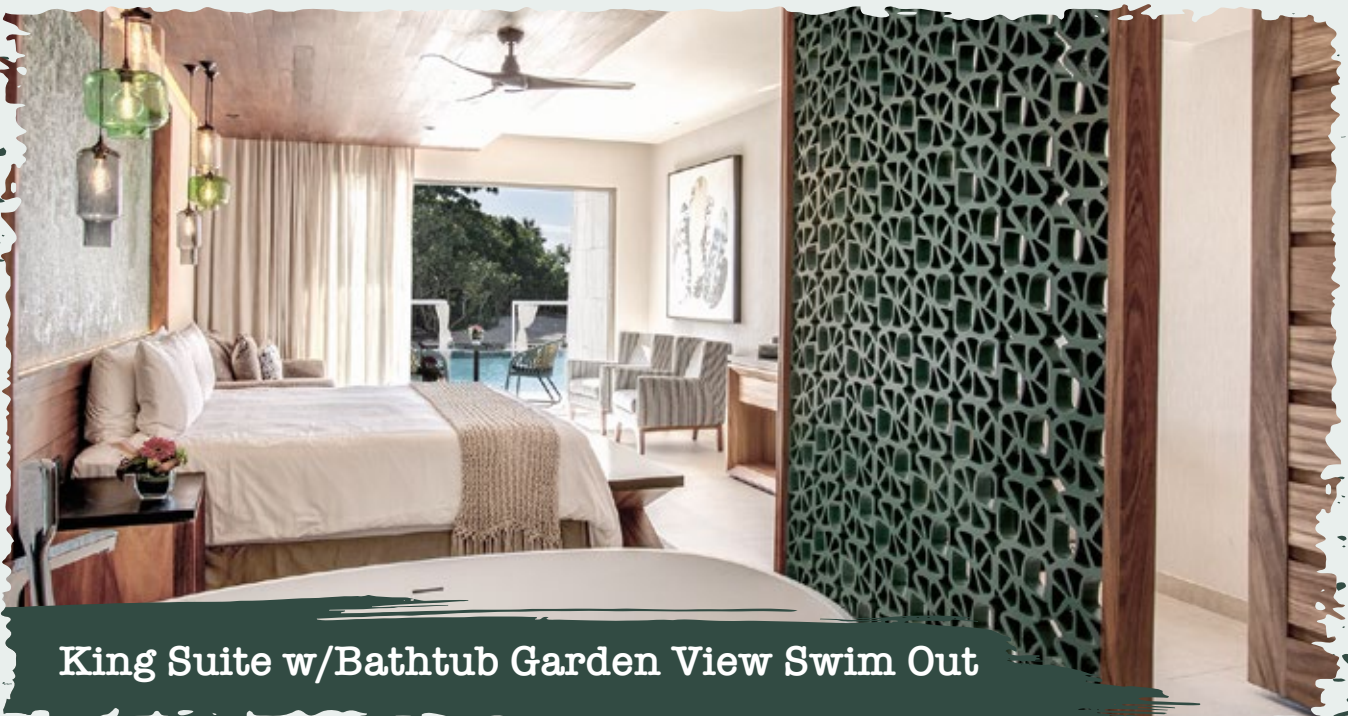
King Suite w/Bathtub Garden View Swim Out